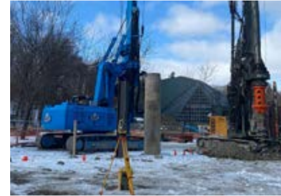
TORONTO ZOO ORANGUTAN OUTDOOR EXHIBIT CLIENT: MIDOME CONSTRUCTION SERVICES

The new outdoor exhibits include high mast poles soaring 13m in the air to support climbing cables for the orangutans which will span across publicly accessible boardwalks and viewing platforms. GEI Consultants has been retained by Midome to complete the design of the geotechnical components of the project including the design-build deep foundation micropile and caisson elements for the high mast poles, permanent support of excavation shoring to support architectural rock form shotcrete, and slope stability assessment within regulated ravine areas..