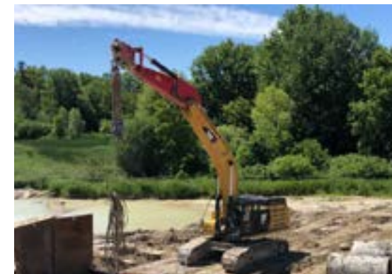
SEATON COMMUNITY LANDS CLIENT: LEBOVIC

GEI's work here includes the Engineering Design and Construction Administration of multiple municipal infrastructure projects including three large subdivisions totaling over 2,700 residential units and five commercial blocks. Our work also includes several regional trunk infrastructure projects, including major arterial road and servicing designs required to support the subdivisions.